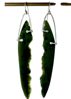
FrameWorx earrings 3 Sterling silver, Pounamu 105mm long x 19mm wide $ 475