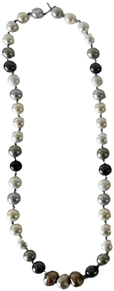
1. Freshwater potato pearls (white, silver, black), handmade silver bead, handmade bronze beads $235

I create unique pieces of jewellery with predominantly recycled pure silver, sterling silver, and also with gold, and brass. I enjoy learning - whether it be about the origin of gemstones and their healing uses or new ways of transforming metals and I am unashamedly a tool geek! I established Studio Toru in 2020 and I am passionate about collaborating with and promoting other artists, adding a little bit more creativity and beauty to the world.