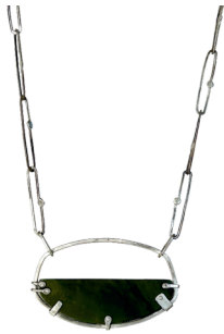
Frame work necklace 1. Sterling silver, Pounamu Chain 500mm length with pendant 67 x 40mm $1,000