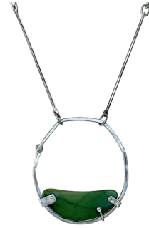
Frame work necklace 3. Sterling silver, Pounamu chain 520mm length with pendant 50 x 56mm $750