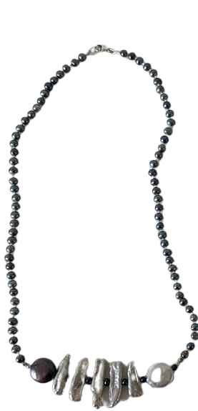
2. Freshwater black pearls, baroque pearls (white, silver black), stg silver clasp $215