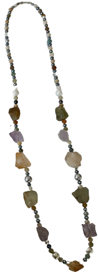
4. Freshwater pearls ( silver, black), seed pearl (white), jasper beads, raw agate, citrine, rose quartz, stg silver beads, $285