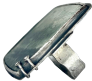
FrameWorx ring 3 Sterling silver, Pounamu Size S top 42 x 47mm $635