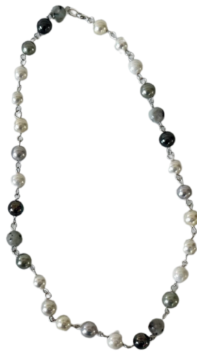
3. Freshwater potato pearls, (white, silver, black) stg silver wire and clasp $255