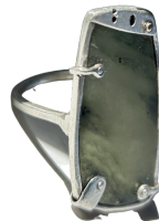
FrameWorx ring 1 Sterling silver, Pounamu, gct gold Size R top 40 x 20mm $ 375